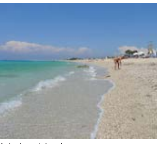
Agios Ioannis beach

Beautiful lawns and gardens front the building which houses eight apartment suites on its ground and first floors. Opulently appointed and very spacious - the minimum size is 50 sq m - each comprises a bedroom with queen sized bed, AC and ceiling fan; living room (also AC) with twin or double sofa-bed; fully equipped kitchen area; walk-in shower; and at least one large covered balcony or terrace with garden or pool views. Facilities include large sat TV, DVD and CD